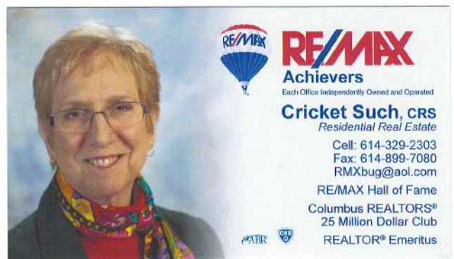
Cricket Such, CRS Residential Real Estate